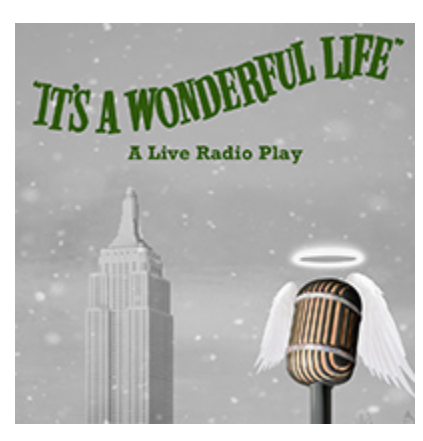
It's A Wonderful Life: A Live Radio Play