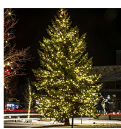
Lighting of Silverthorne & Holiday Market

All events are subject to change and/or cancellation due to COVID-19 and current Public Health Order. Check individual web sites for the most up-to-date information.