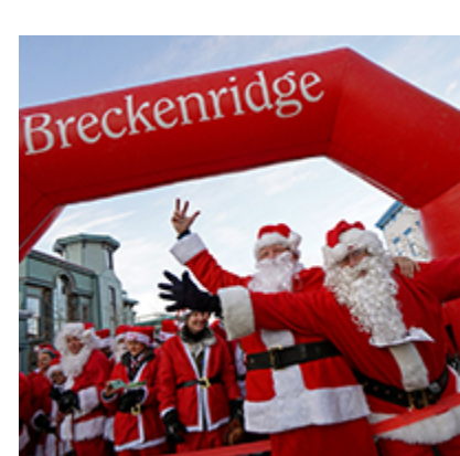
Lighting of breckeringe a

Race of the Santas Breckenridge Tourism Office