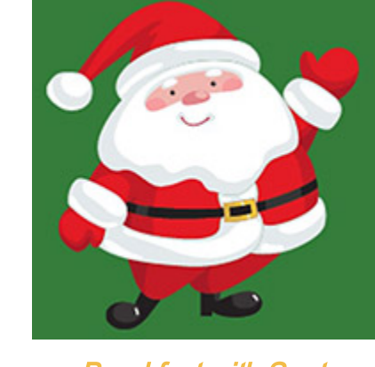
Breakfast with Santa