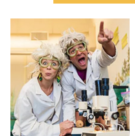
Family Fun Night Mountain Top Explorium

All events are subject to change and/or cancellation due to COVID-19 and current Public Health Order. Check individual web sites for the most up-to-date information.