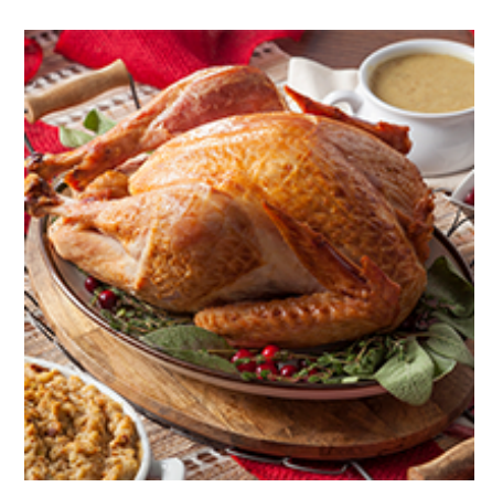
Free Community Thanksgiving Dinner