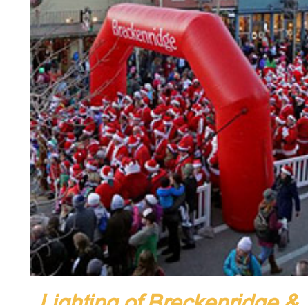
Lighting of Breckenridge & Race of the Santas