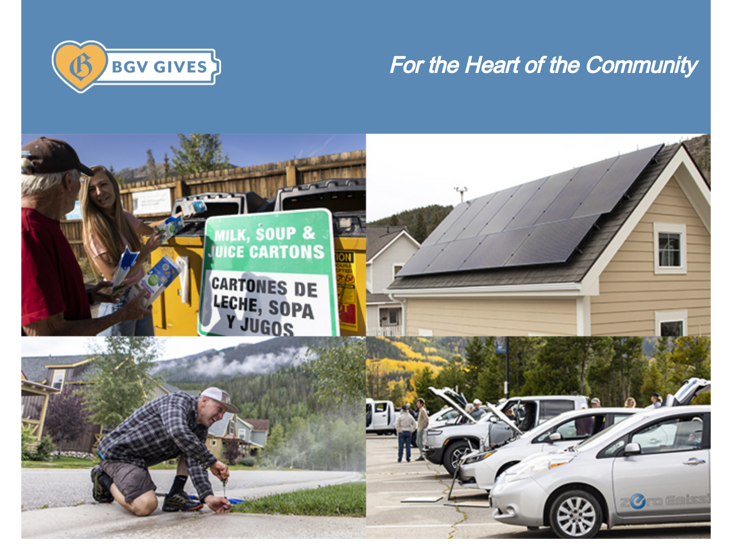
High Country Conservation Center Makes Waste Reduction and Resource Conservation Easy in our Mountain Community

Have you ever wondered if your carton of almond milk is recyclable? Or wondered what it would be like to drive an electric vehicle in the mountains...during winter? The <u>High Country Conservation Center</u> (HC3) is here for you. Here are just a few ways their work helps you and all of Summit County.