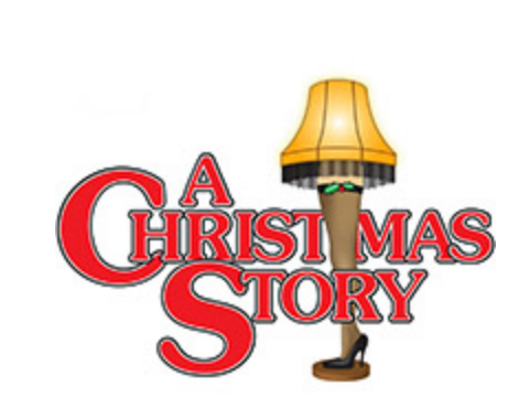
A Christmas Story