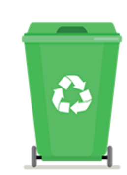
61,434 lbs COMPOST